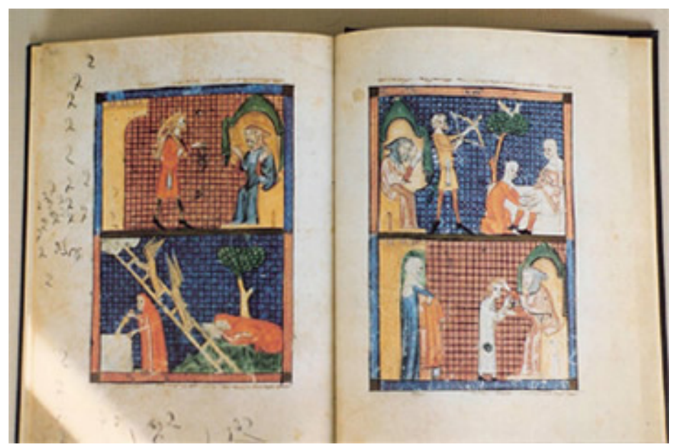
The Sarajevo Haggada

The Sarajevo Haggada contains poems, prayers and paintings about Passover and the escape of the Jews from Egypt. It was made between the 12th and 14th centuries, and was brought to Bosnia by the Cohen family in the 16th century, after Isabella expelled the Jews from Spain. It is perhaps the most beautiful and important haggada in existence. Scholars from all the world come to see it. But when people come now, I show them a copy. The original is safe and sound.