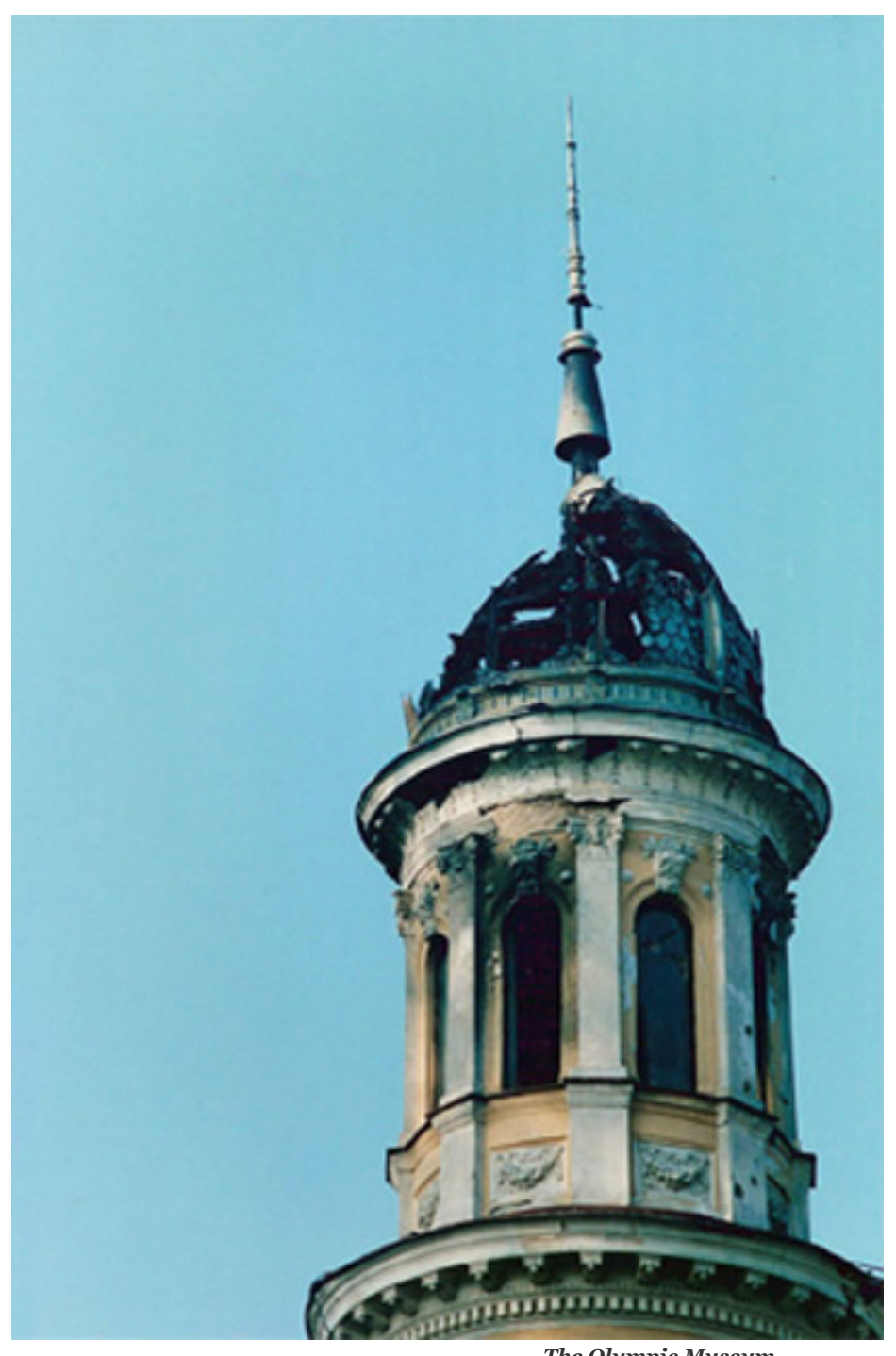
The Olympic Museum

The Olympics were really something fantastic here. Now, a beautiful old building from the Austrian era and all the documentation of the Sarajevo games have been destroyed.